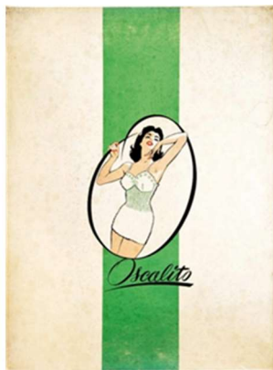
Boccasile per Oscalito, 1950

The Casalini brothers purchased only the highest quality natural fibres; indeed, the geographical section encompassing Turin and the area around Biella has been synonymous with manufacturing excellence since the seventeenth century. They acquired a secondhand Schubert&Saltzer circular knitting machine and set it up in a workshop inside the courtyard of some old houses along the river; they began to produce beautiful knitted circular fabrics in wool and cotton for seamless underwear, focusing on special details. Basing their production on the complex classic rib stitches, which gave perfect fit without constricting the body, Oscalito manufactured knitwear lines for men, women and children.